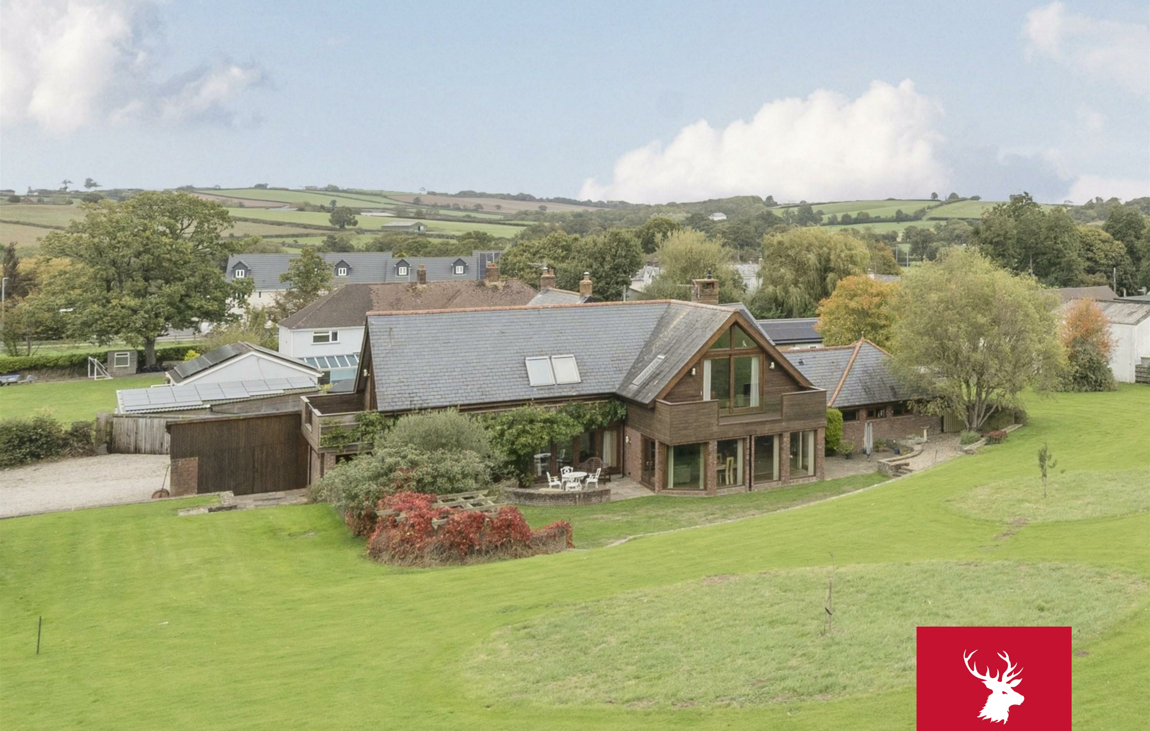
Bramley House and Development